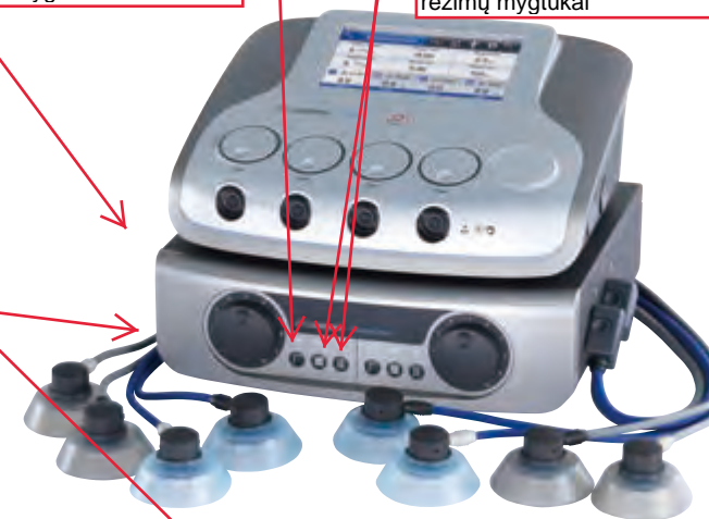
SU-540 with ES-5400