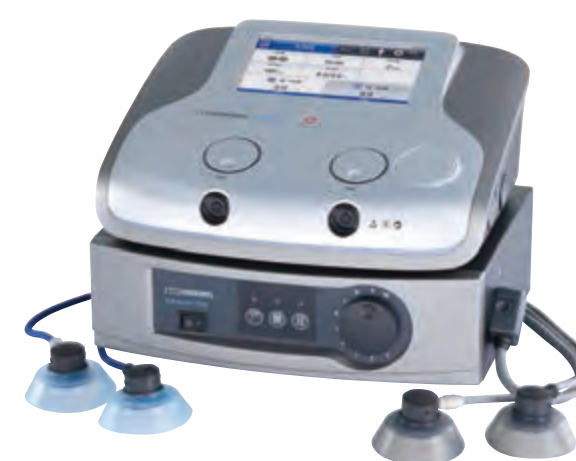
SU-520<BK> with ES-5200

SU-540 for ES-5400 and SU-520<BK> for ES-5200, both models adopt blow-out vacuum system, and therefore no water reservoir is needed. It is virtually maintenance-free, since dust or moisture does not adhere inside the tube or on the connections, resulting in preventing blockages and oxidation.